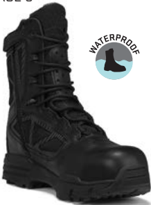
CHROME TR998Z WP CT PAGE 15