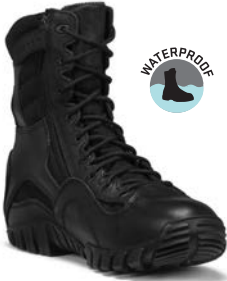
KHYBER TR960Z WP PAGE 8