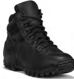
KHYBER TR966 PAGE 8