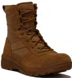
SPEAR POINT BV518 PAGE 4