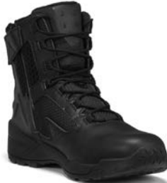
TR1040-LSZ PAGE 6