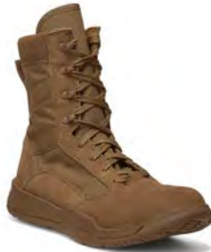
AMRAP TR501 PAGE 17