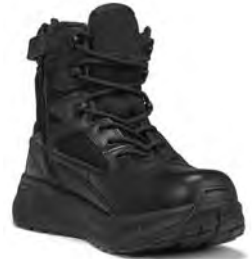
MAXX 6Z PAGE 12