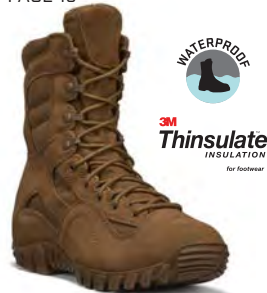
KHYBER TR550WPINS PAGE 10