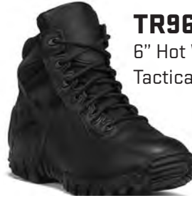
TR966 / 6" Hot Weather Lightweight Tactical Boot

MEN'S Full Sizes: 3 - 16, R & W Half Sizes: 3.5 - 11.5, R & W