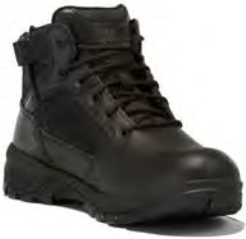
SPEAR POINT BV915Z PAGE 4