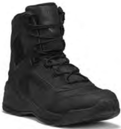
TR1040-T PAGE 6