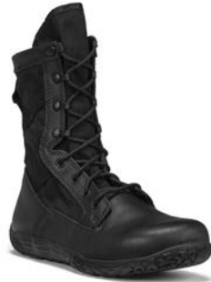
MINI-MIL TR102 PAGE 14