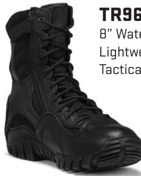
TR960Z WP / 8" Waterproof Lightweight Side-Zip Tactical Boot