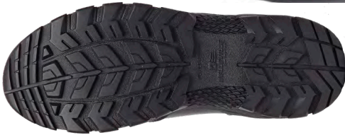
ZONE TRACTION RUBBER OUTSOLE