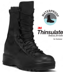
770 PAGE 16