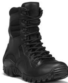
KHYBER TR960 PAGE 8