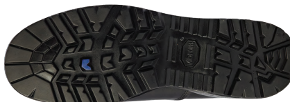
VIBRAM® SIERRA FIRE & ICE™