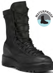
700 PAGE 16