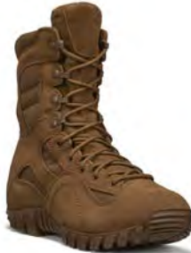
KHYBER TR550 PAGE 10