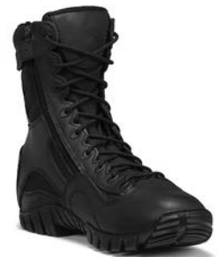
KHYBER TR960Z PAGE 8