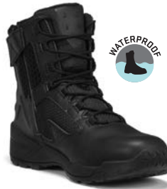
TR1040-ZWP PAGE 6