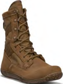
MINI-MIL TR105 PAGE 14