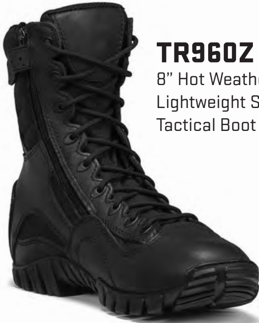
TR960Z / 8" Hot Weather Lightweight Side-Zip Tactical Boot