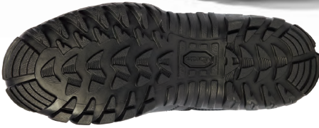
EXCLUSIVE VIBRAM® IBEX