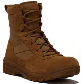
BV518 / 8" Hot Weather Lightweight Tactical Boot