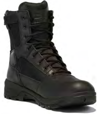
BV918Z WP / 8" Lightweight Side-Zip Waterproof Tactical Boot