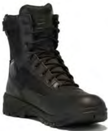
SPEAR POINT BV918Z PAGE 4