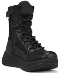
MAXX 8Z PAGE 12