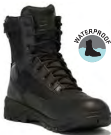
SPEAR POINT BV918Z WP PAGE 4