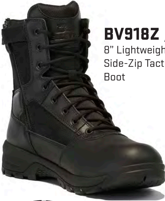
BV918Z / 8" Lightweight Side-Zip Tactical Boot