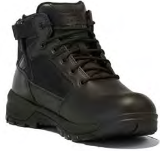
BV915Z / 5" Lightweight Side-Zip Tactical Boot

MEN'S Full Sizes: 4 - 15, R & W Half Sizes: 4.5 - 11.5, R & W